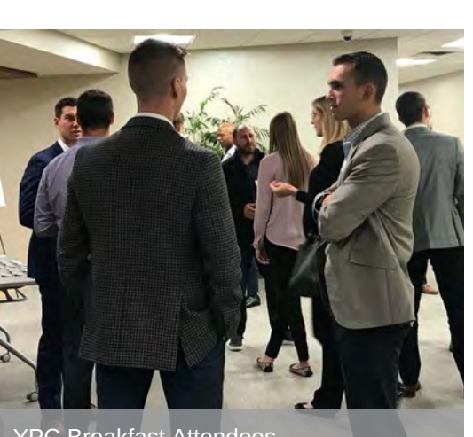
YPC Breakfast Attendees