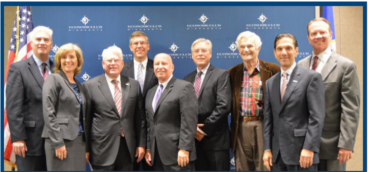
Congressman Kevin Brady, Chairman of the House Ways & Means Committee, with ECOM guests